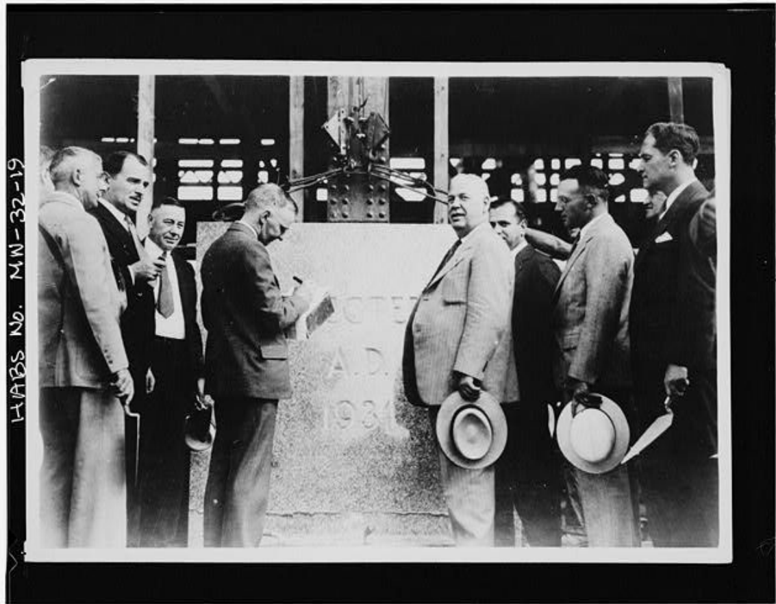
Cornerstone Ceremony (1931).